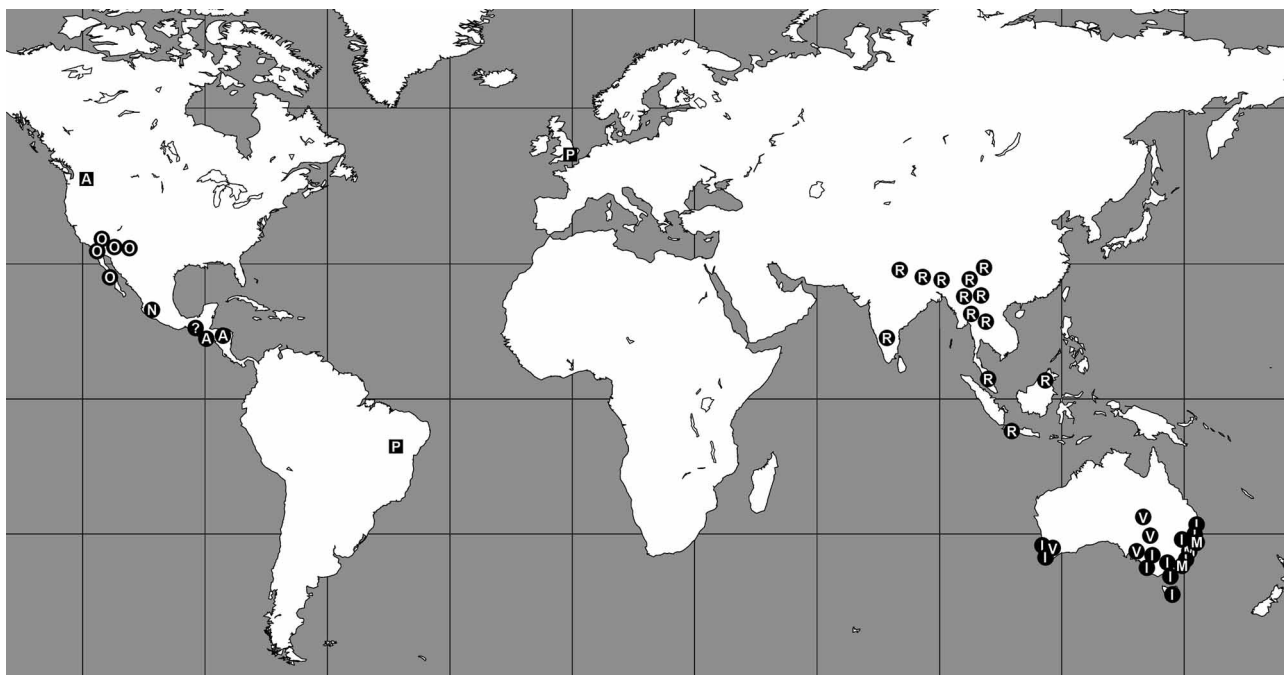
FIGURE 1. Distribution of extant and fossil Ithonidae. Circles indicate extant genera: A, Adamsiana ; O, Oliarces ; N, Narodona ; ?, unknown genus; R, Rapisma ; I, Ithone ; V, Varnia ; M, Megalithone ; squares indicate fossil genera: A, Allorapisma (Early Eocene); P, Principiala (Early Cretaceous).

Institutional abbreviations: SRIC, Stonerose Interpretive Center, Republic, Washington (U.S.A.).